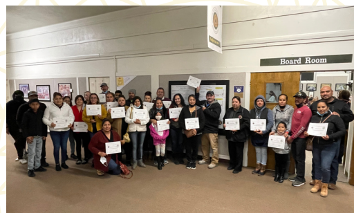
Parents of English Learner students graduate the Parent Institute for Quality Education (PIQE) Program in December 2021. The parents were recognized at a Board of Trustees meeting. PIQE educates parents on how to provide a positive educational environment for their children both at home and at school.