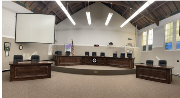
The newly constructed tables in the Marysville Joint Unified School District's Boardroom, where regularly scheduled meetings of the Board of Trustees occur. Sept. 13, 2022.