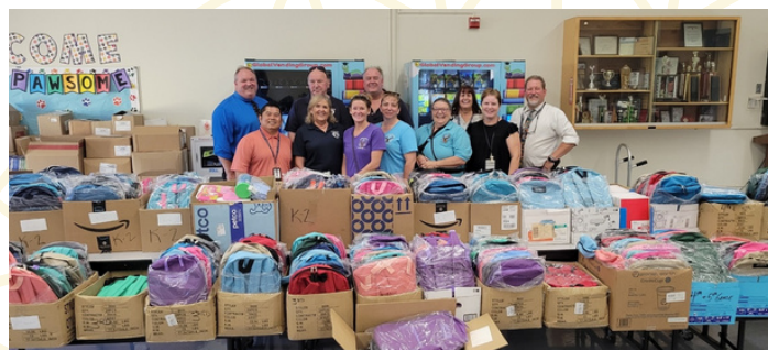
Elks Lodge officers with Covillaud and District administrators after delivering over 500 backpacks, school supplies, and a $500 check.

“It’s so nice to have connections with community members,” she said.